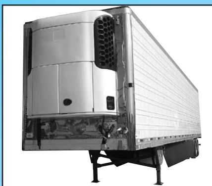
(5) 2013 UTILITY 53' T/A REEFERS WITH TK UNITS