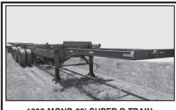
1998 MOND 20' SUPER B TRAIN CHASSIS SETS SLIDING TRIDEM/UPPER FRAME LEAD. -97565