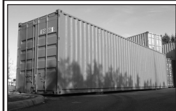
(1) 40' SHIPPING CONTAINER -1319879