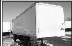
28' PUP TRAILERS FOR STORAGE USE -1297846

ASK ABOUT OUR 48' & 53' VANS AVAILABLE FOR RENT!