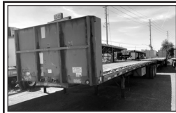
2005 THRUWAY 45' STEEL FLATBED AIR RIDE, 49" TANDEM ON SLIDING SUSPENSION - 1292560