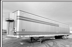
2007 GREAT DANE 53' HEATED VAN TANDEM A/R, NO ENG. -1308344