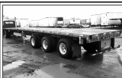
2008 LODE-KING 53' COMBO TRIDEM FLATBED ON SLIDING SUSPENSION. -314625