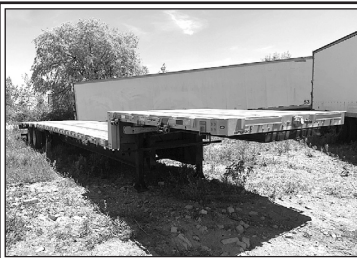
2014 FONTAINE 53' ALUM. COMBO STEP DECK T/A, A/R, REAR AXLE SLIDE -1302471