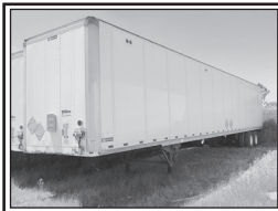
2011 STOUGHTON 53' PLATE VAN TANDEM, AIR RIDE -1302473