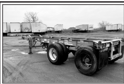
2005 CHEETAH 20'-40' TANDEM AXLE CONTAINER CHASSIS SPRING RIDE SUSP; CAN BE CERTIFIED. -1319878