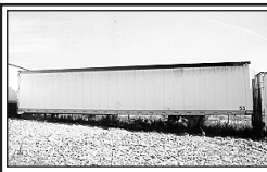
1995 GREAT DANE 53'x102"x110" TRAILER BOXES, AVAILABLE. -35080