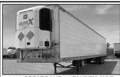
2013 GREAT DANE 36' TANDEM AXLE REFRIGERATED VAN AIR RIDE SUSP; EVEREST T/L C/W THERMOK- ING SB310 REEFER UNIT. 11,800 HRS -1312801