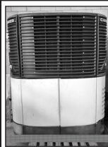
CARRIER PHOENIX ULTRA REEFER UNIT 12,000 HOURS, IN RUNNING CONDITION. -1265389