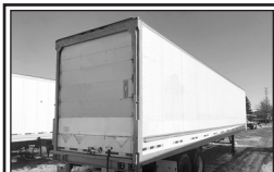
2005 MANAC 48' DRY VAN TANDEM, A/R, ROLL UP REAR DOOR -102220