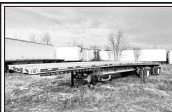
2007 MANAC 48' ALUMINUM FLAT TANDEM A/R. -1308345